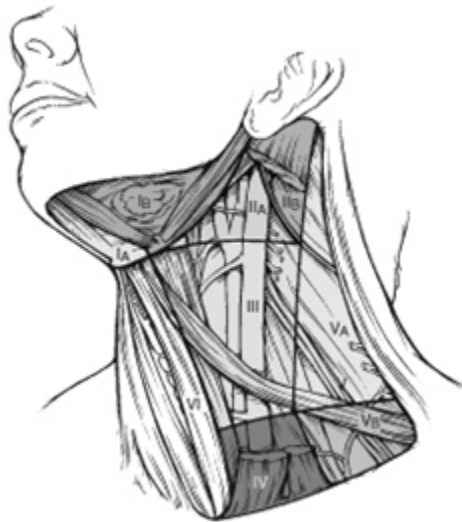
Figure 2. The six sublevels of the neck for describing the location of lymph nodes within levels I, II, and V. Level IA, submental group; level IB, submandibular group; level IIA, upper jugular nodes along the carotid sheath, including the subdigastric group; level IIB, upper jugular nodes in the submuscular recess; level VA, spinal accessory nodes; and level VB, the supraclavicular and transverse cervical nodes.

In order for pathologists to properly identify these nodes, they must be familiar with the terminology of the regional lymph node groups and with the relationships of those groups to the regional anatomy. Which lymph node groups surgeons submit for histopathologic evaluation depends on the type of neck dissection they perform. Therefore, surgeons must supply information on the types of neck dissections that they